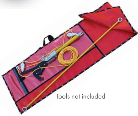
Tools not included