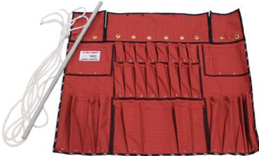
TENM418 complete Kit