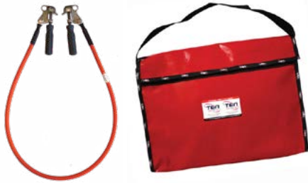
Jumpers not included