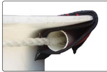
Conduit/Rope shown applied to liner (Included in TENM418)