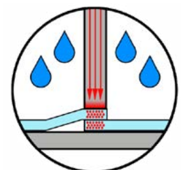
Welded Seam Icon