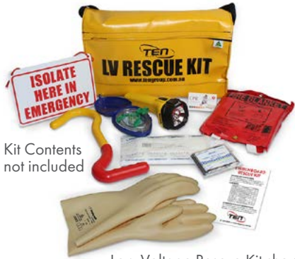
Kit Contents not included