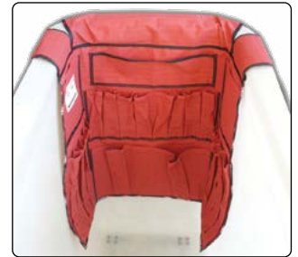
TENM418 Apron shown attached inside the Bucket