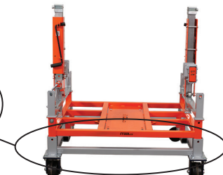
RPJ10K shown with Transport Frame & Castor Set Sold Separately