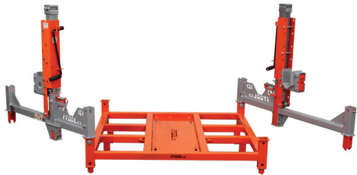
RPJ10K shown with side gates open for Drum placement