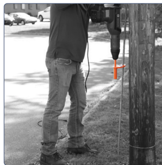
Drive the rod down to a comfortable height