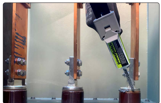
Leaking Switchgear Repair