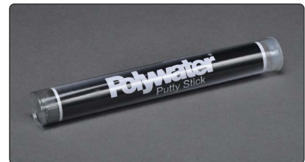
Part No. EP-STICK4