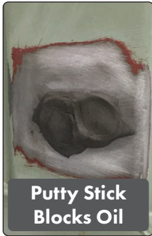
Putty Stick Blocks Oil