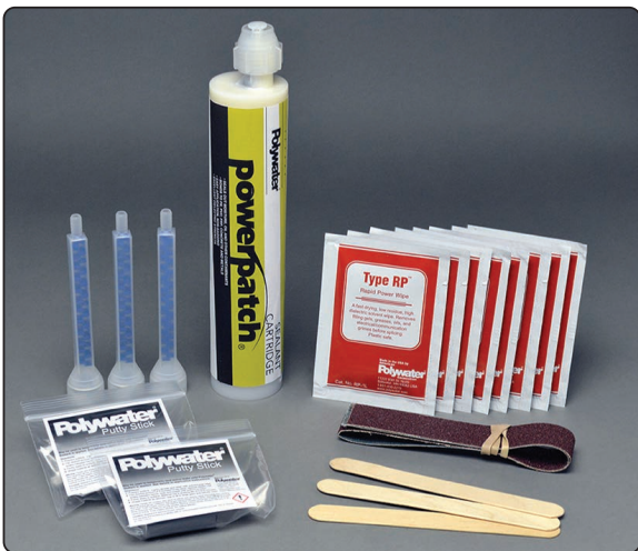
Part No. EPCT-250KIT1 (Large Format)