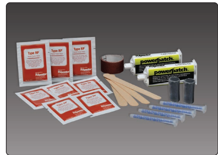
Part No. EPCT-KIT1