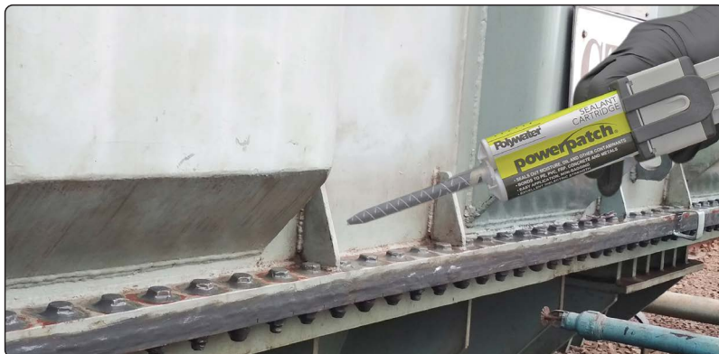
Major Substation Leaking Transformer Repair