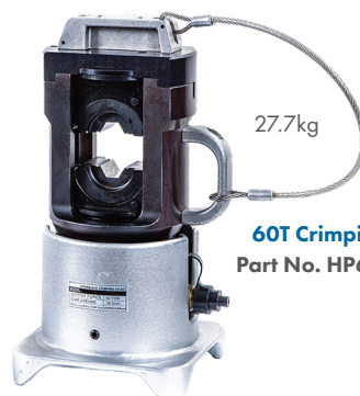
60T Crimping Head Part No. HP60TC-SA-A