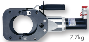
105mm Armoured Cutting Head Part No. SDG105C