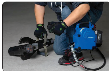
Pump shown above with optional cutting head and a hydraulic hose