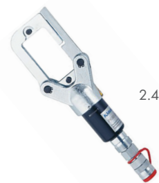
Multi Head Crimping/Cutting/Punching Part No. PK60UNVC