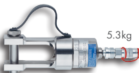
25T Crimping Head Part No. HP25T-SA