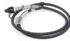
2m Hose c/w Male Couplers