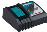
Makita Charger Part No. DC18RC