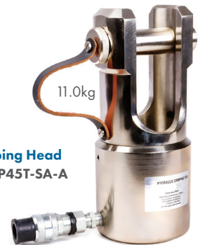
45T Crimping Head Part No. HP45T-SA-A