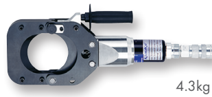
85mm Armoured Cutting Head Part No. SDG852C