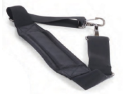
Padded Carry Strap

NON-CONDUCTIVE HOSES AVAILABLE UPON REQUEST