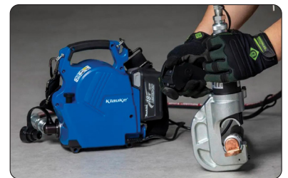
Pump shown above with optional crimping head and a hydraulic hose