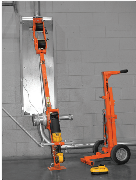
Includes Cart & Addaptors