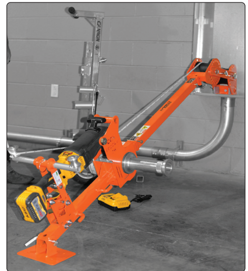
Fully Self Contained Unit