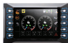
7" COLOUR DISPLAY