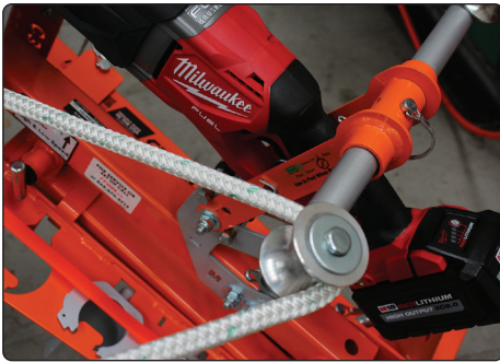
Safety Rope Diversion allows Operator to stand out of pulling line

Ideal for Overhead & Underground Pulling