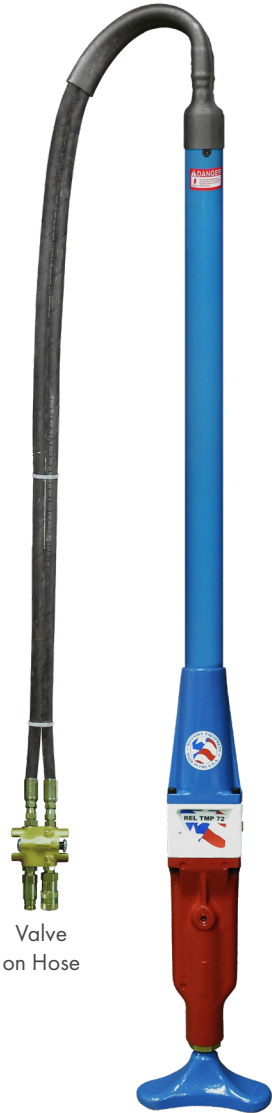
Valve on Hose