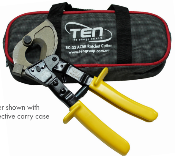
Cutter shown with protective carry case