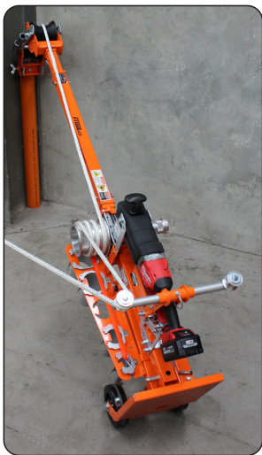
Ready for operation remote locations