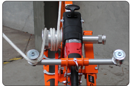
Versatile Duel Capstan