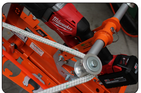
Safety Rope Diversion Operator stands out of pulling line