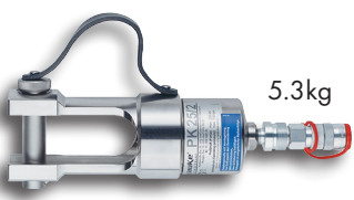
25T Crimping Head Part No. PK252C