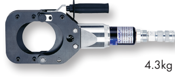
85mm Armoured Cutting Head Part No. SDG852C