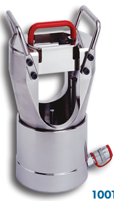
100T Crimping Head Part No. PK1000C