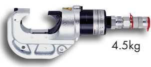
12T Crimping Head Part No. PK12042FPC