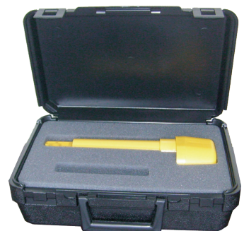
Optional Hard case with foam Part No. LT-220-CASE