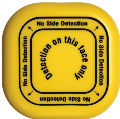
LT220 Detection Face