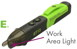
Work Area Light