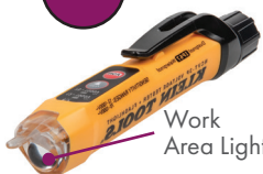
Work Area Light