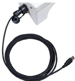
3m Charging cord