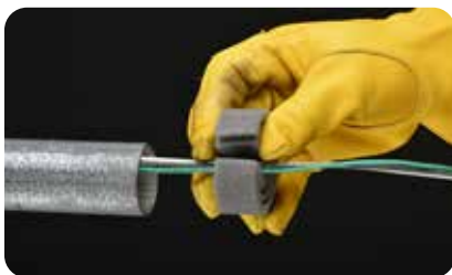
Positioning the Conductors