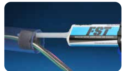
Insert nozzle past the first dam