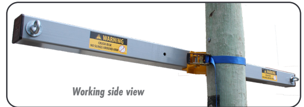
Working side view