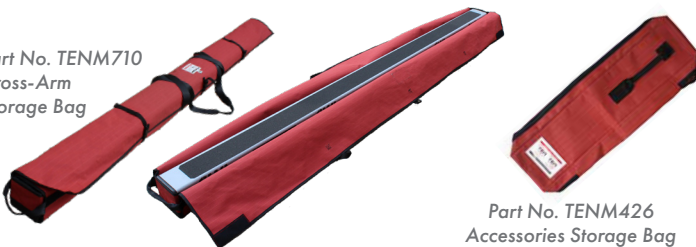
Part No. TENM426 Accessories Storage Bag