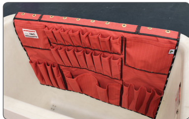
Straight secured with rope

TEN's Heavy Duty Apron has additional eyelets across the width of the apron for bracket hanging, heavy duty double stitched pockets, and triple stitching in high wear areas