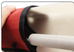
Apron folds over bucket lip and ties underneath using rope & conduit