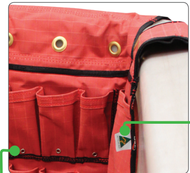
Water drip holes in pockets