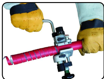
Stripping outer sheathing

Graduated knurled knob in 1/10mm from 0 to 1.1 mm for accurate adjustment of the scoring blade for strippable semi-conductor