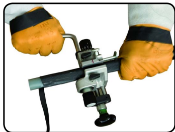
Scoring strippable semi-conductor