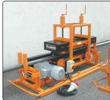
EKR700 - motor side