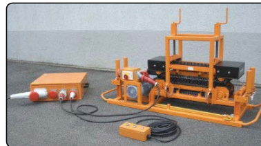
EKR700 for series connection with switch board and cable remote control