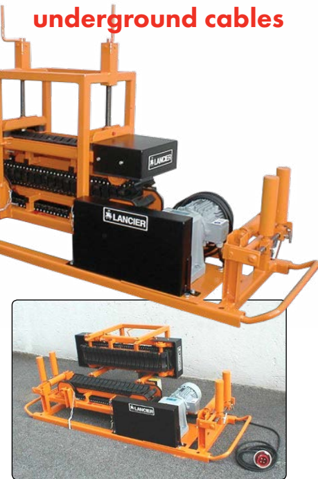
EKR700 - drive side opened