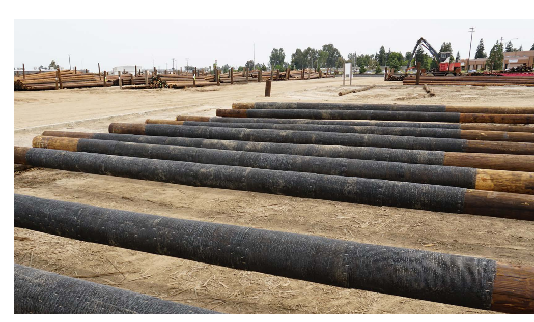
Poles in a yard pre-wrapped with FireMesh ready for install

Fire Mesh is a proven, effective and economical solution to a fire risk for utilities, railroad and construction companies. TEN is proactively stocking fire mesh for Australian utilities ahead of another fast approaching fire season. For more information on the fire mesh and its potential application in your utility, contact Lindsay Taylor on 0400 968 238 or lindsay@tengroup.com.au