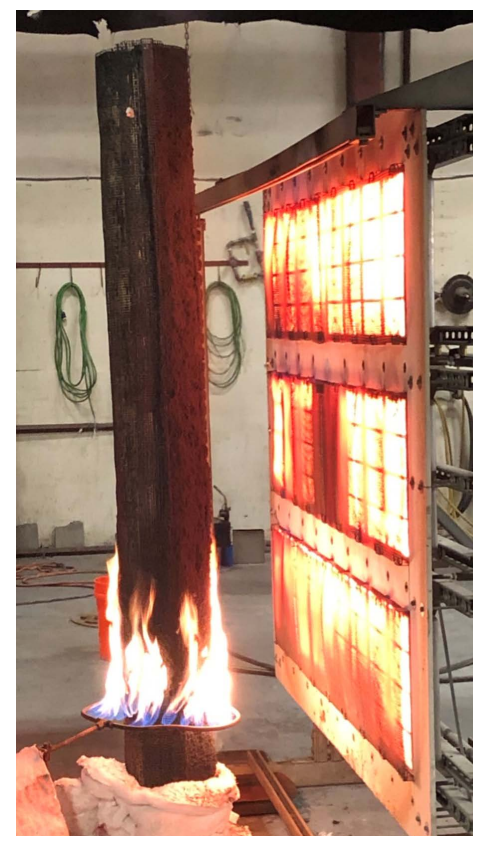
Radiant Heat Panel set to 980°C during Testing at theWestern Fire Centre in Washington

Genics Fire Mesh™ is a protective barrier designed to protect structures from wood burning and scorching. It is vital for a wood pole to achieve equilibrium and homeostasis with the climatic conditions associated with its placement, therefore, the best product solution is one that promotes air exchange and allows the pole to breathe. The Fire Mesh™ is designed with an open grid that allows visibility of the timber behind it, and most importantly, allows the pole to breathe. Combining state of the art polymers with innovative fire-resistant compounds, Genics Inc was able to create a very durable and high performing intumescent grid that has achieved excellent fire resistance in many standardized tests and controlled burns. The mesh is extremely durable and can be applied to new poles before transport to fire prone areas. There is also a favourable environmental and safety profile, the product is animal safe, there is no leaching of chemicals and it is safe to handle.