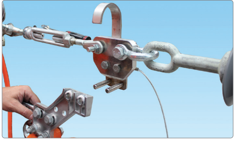
Quick pin bracket for fast and easy installation.