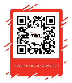
CLICK or SCAN to see the Siemens Portable Switch video made in conjunction with UK Power Networks.

CUSTOM Jumpers, Hardware & Hanging Assemblies built to your specifications by TEN