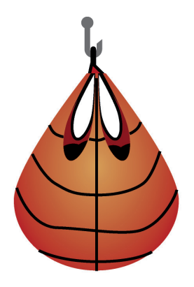
2 Gather Tarp Loops for easy lifting