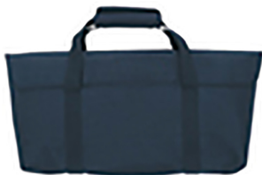
Canvas carry bag (Included)