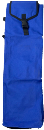
Protective Carry Case (Included)