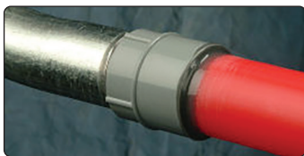
PE to Steel