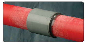
PE to PE