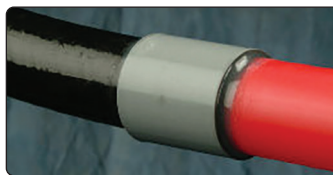
PE to Fibreglass