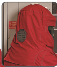
FH40RG & Paulson passive venting