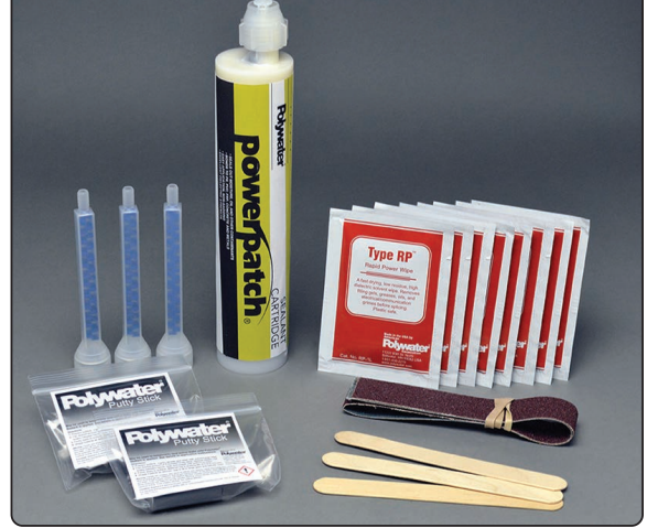
Part No. EPCT-250KIT1 (Large Format)