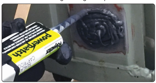
Leaking Pole Mounted Transformer Repair