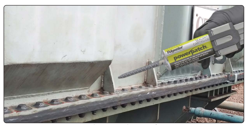
Major Substation Leaking Transformer Repair