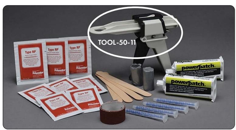
Part No. EPCT-KIT1-G - Includes TOOL-50-11 application tool