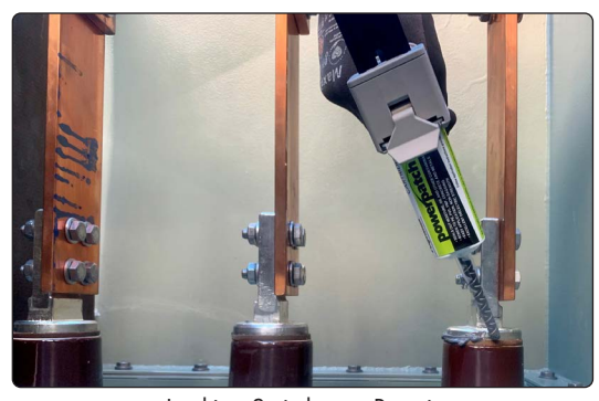
Leaking Switchgear Repair