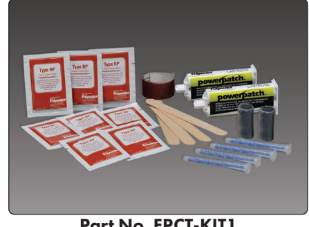
Part No. EPCT-KIT1