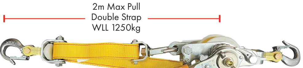
2m Max Pull Double Strap WLL 1250kg