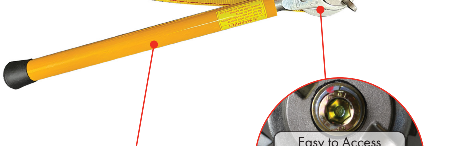
Fibreglass handle rotates 360°