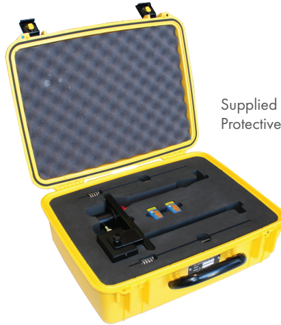
Supplied in a Rugged Protective Carry Case